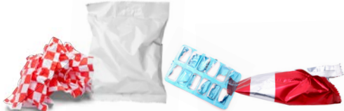
Mixed material bags