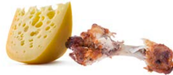
Meat, dairy, oil & fried foods

→ these materials can be composted, but risk attracting pests