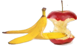
Fruit & vegetables