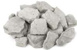
Demolition & construction waste