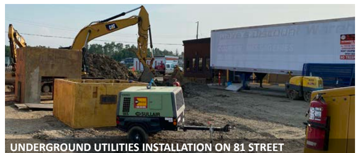
UNDERGROUND UTILITIES INSTALLATION ON 81 STREET