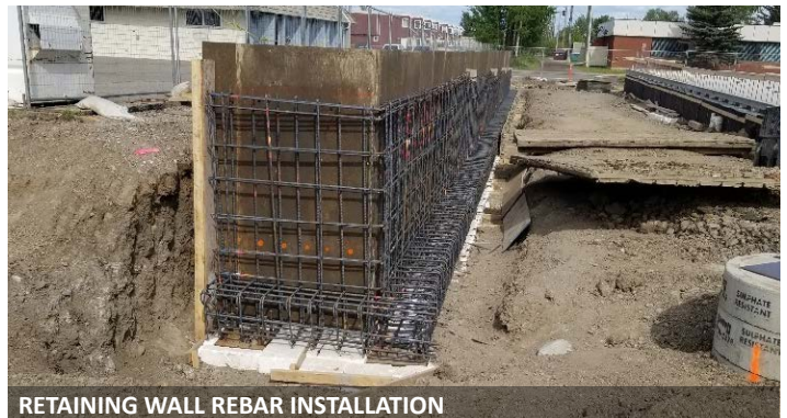
RETAINING WALL REBAR INSTALLATION